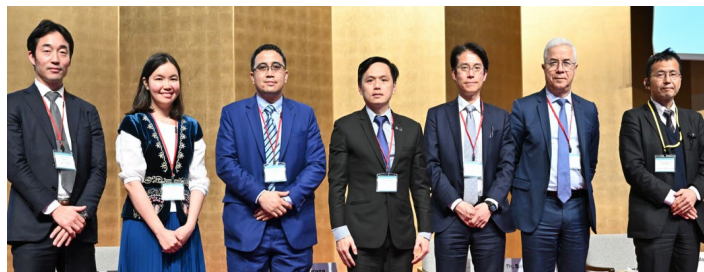
Participants of Panel 3

On the other hand, with the backlash against fossil fuels, efforts to resolve issues toward the stable supply of transient energy were also revealed. We strongly felt the necessity of advancing the development of technologies that contribute to building a value chain of sustainable energy through international co-creation that utilizes the strength and characteristics of each country and within a more realistic timeline. (From the Chairperson’s review)