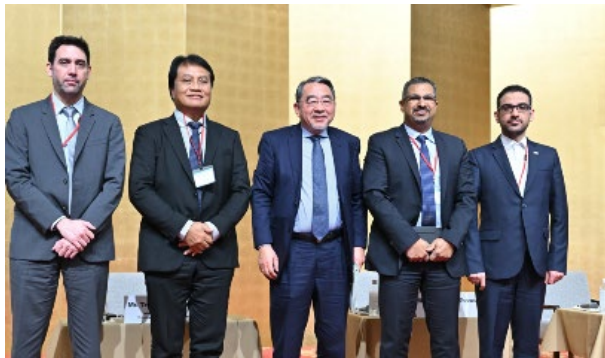
Participants of Panel 1

At Leaders Panel 1, there was an active exchange of opinions among government officials from Middle Eastern and Asian oil and gas producers, and Japanese and foreign experts in the oil, gas, energy, and technology fields on the stable supply of energy and implementation of green transformation. The oil and gas industries face common challenges such as carbon neutrality and stable supply, further increasing opportunities for cooperation between respective countries and companies. We re-confirmed the importance of cooperation among the oil and gas industries of consumers and producers in order to continue contributing to the international community through the energy business.